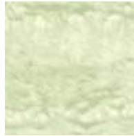
sage marble (gloss)