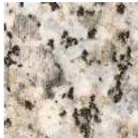
grey/blue marble (gloss)