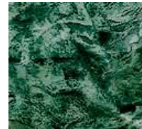
emerald marble (gloss)

The marble finishes are created using Fablon. If you wish to use a similar finish of your own choice, you should purchase the lightwood finish, and use this.