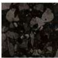
gloss black/silver granite