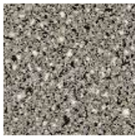
dark granite (gloss)